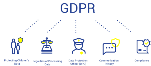
FIGURE 2. General Data Protection Regulation (GDPR)

In conclusion, ML techniques have profoundly impacted customer behavior analytics through predictive analytics, personalized customer experiences, real-time data processing, sentiment analysis, and customer segmentation. These advancements enable businesses to gain deep insights into customer behavior, enhance customer engagement, and drive strategic decision-making Ngai et al., 2011. As ML algorithms continue to evolve, their applications in customer behavior analytics are expected to expand, offering even